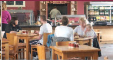
COFFEE & GIFT SHOP