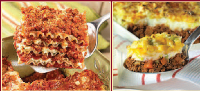
Dishes made with mince beef

Mince beef is one of the most affordable, versatile and tasty of all meat products. Its use dates back to ancient times and is a good source of phosphorous and iron (phosphorous is necessary for strong teeth and bones and iron helps carry blood to cells and muscles helping to prevent fatigue).